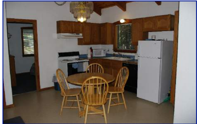
Blue Jay Cabin